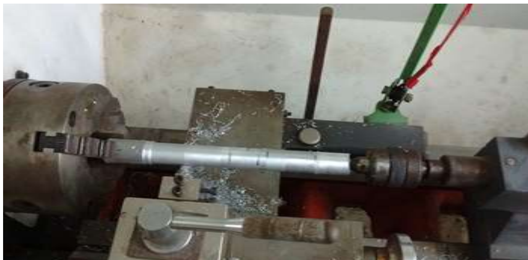
Fig.5 VARIOUS SURFACES MACHINED FOR Al 2 O 3 AND SIC COMPOSITE MATERIAL