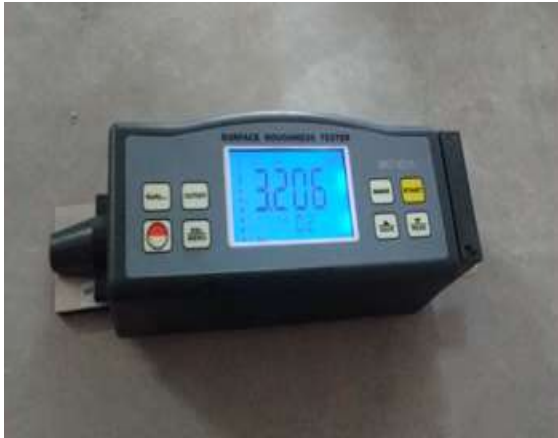
Fig.3 SHOWS SURFACE ROUGHNESS