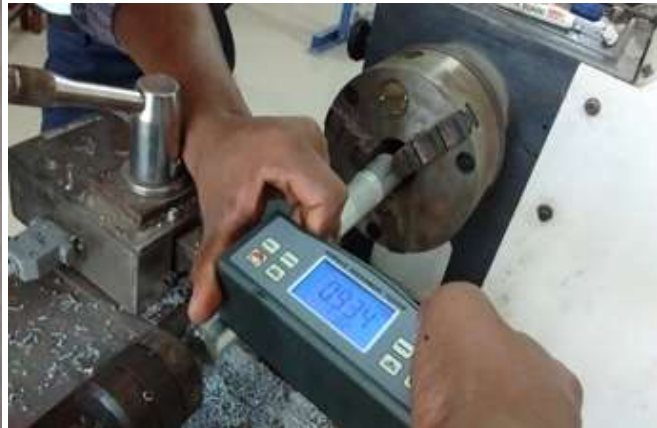
Fig.4 SHOWS MEASUREMENT OF SURFACE TESTER