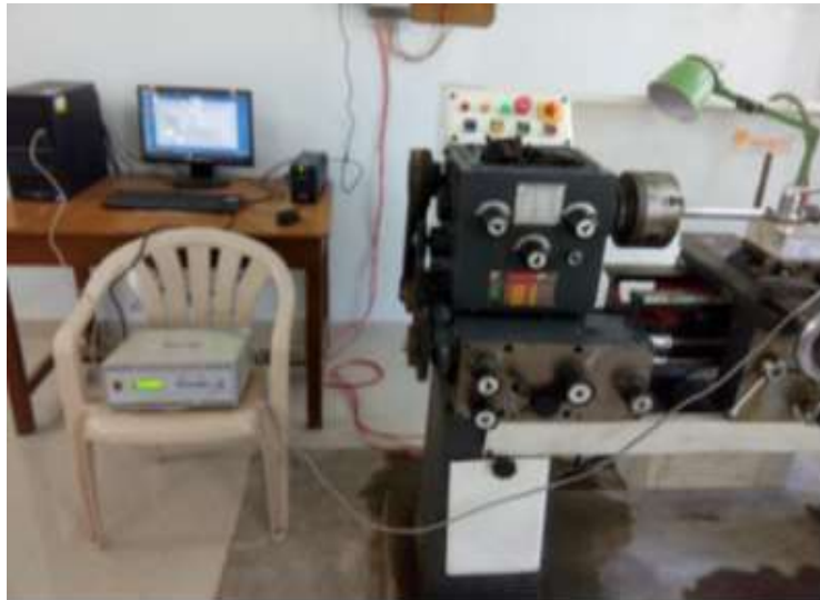
Fig.2 SHOWS TOOL DYNAMOMETER SET UP

It is a device used to measure the force exerted by tool to the work piece. We are measuring three types of forces ( F_x , F_y , F_z ). F_x =Feed force F_y =Thrust force F_z =cutting force.