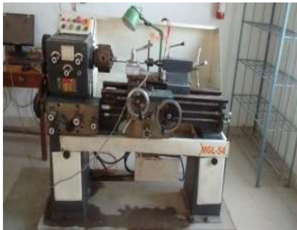
Fig.1 High Speed Lathe Machine

It consists of 8 spindle speeds ranging from 70 R.P.M, 116, 186, 269, 315, 525, 842, and 1250. Each speed consists of 4 different feeds.